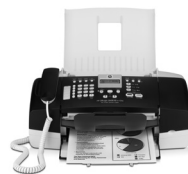
HP Officejet J3608 All-in-One

Print vivid colours, get fade-resistant faxes and communicate easily with the built-in phone – all from one compact all-in-one.